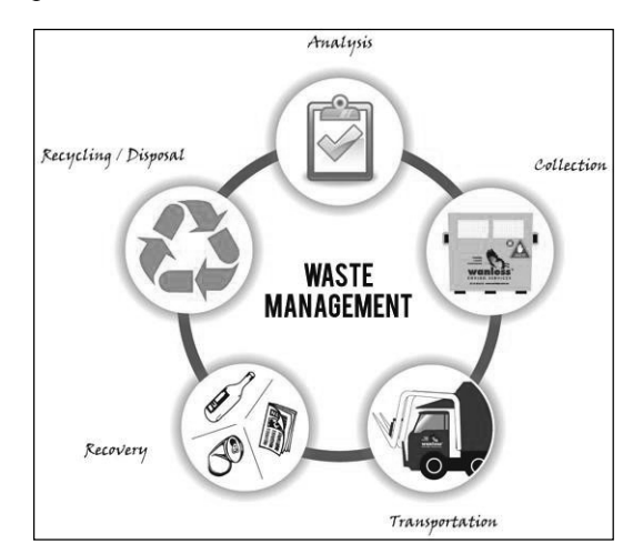
Figure 1: Steps involved in waste management

challenge in the urban cities is solid waste management. Hence, such a system has to be build which can eradicate the problem or at least reduce it to the minimum level.